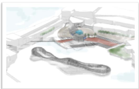
Isabel Diez De Ulzurrun, Theatre concept