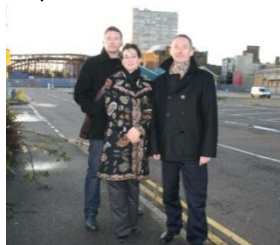
January Project team arrive