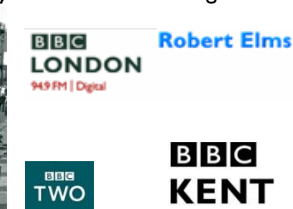
August Media circus in Margate