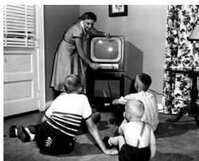
February BBC Kent broadcast