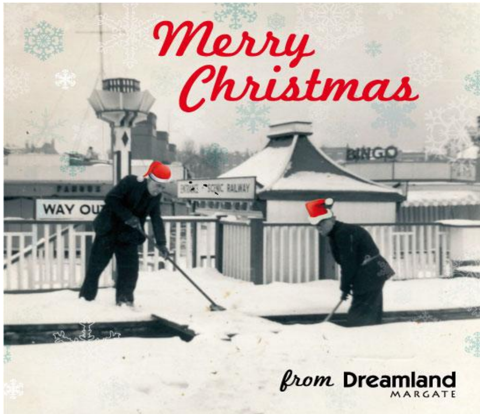
Eric Sillers clearing Dreamland's Scenic Railway