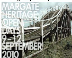
September Heritage Open Day