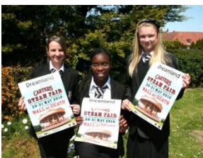
October Dreamland Youth Panel