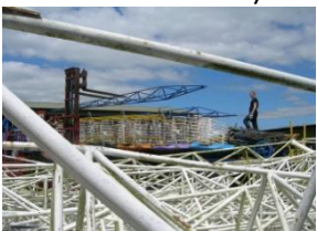
June Corbiere Wheel delivery