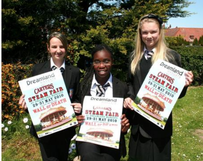
Dreamland Youth Panel: Image by Peter Barnett