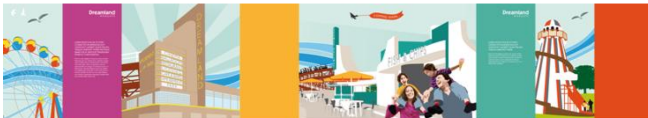
Section of the Dreamland hoarding work in progress

To tell Margate's visitors about the work we are doing and the plans for the future Dreamland, The dreamland Trust has commissioned a 25m hoarding in front of the Marine Terrace Gap. A sneak preview of the work in progress above - this is just a section of the hoarding.