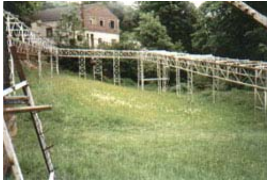
3.5.2 General view of the construction from beneath