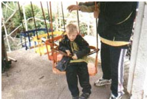
3.5.3 The top station