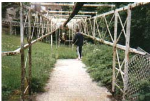
3.5.5 Around the last corner – attendant waiting at bottom station