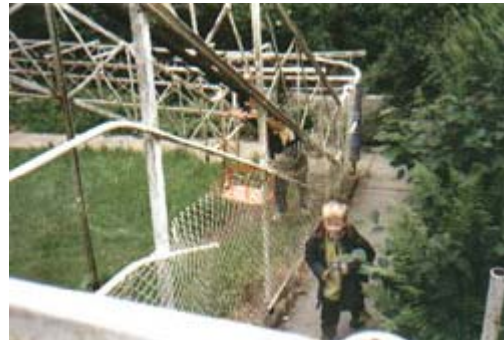
3.5.6 Back to the top – the passenger walks, the car is hauled back by motor.

3.6 In addition to the Aerial Glide, there were many other rides added and there were other attractions. At one time there was even a bear and a lion in cages not much bigger than the animals. The heyday of the Pleasure Grounds was the 1930s and 1950s and it is clear that some of the existing rides are from that period. A vintage swing-boat set still remains. Some original penny slot machines also survive alongside their modern counterparts.