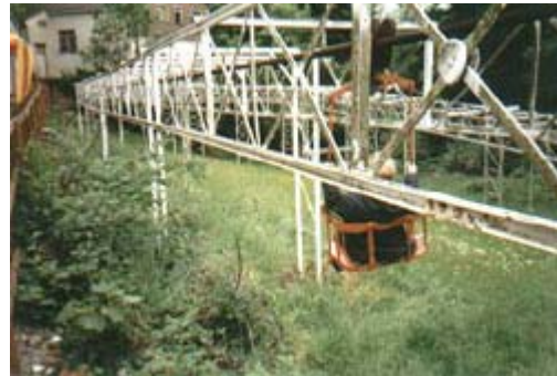
3.5.4 Away from the top station