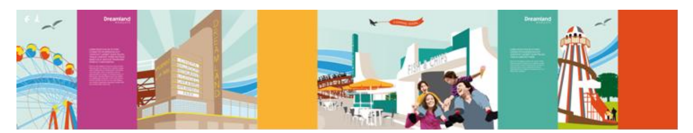
Section of the Dreamland hoarding work in progress

To tell Margate's visitors about the work we are doing and the plans for the future Dreamland, The dreamland Trust has commissioned a 25m hoarding in front of the Marine Terrace Gap. A sneak preview of the work in progress above - this is just a section of the hoarding.