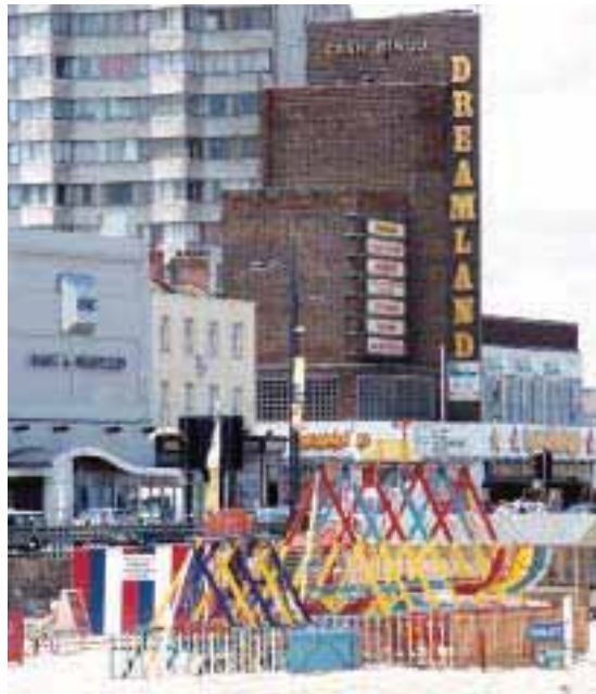
NEW LIFE: Dreamland Cinema is now undergoing restoration work

The council is working in partnership with the Dreamland Trust to create a world first for the site, an amusement park of thrilling historic rides. The project has already received funding from the council, Department for Culture, Media and Sport and the Heritage Lottery Fund.